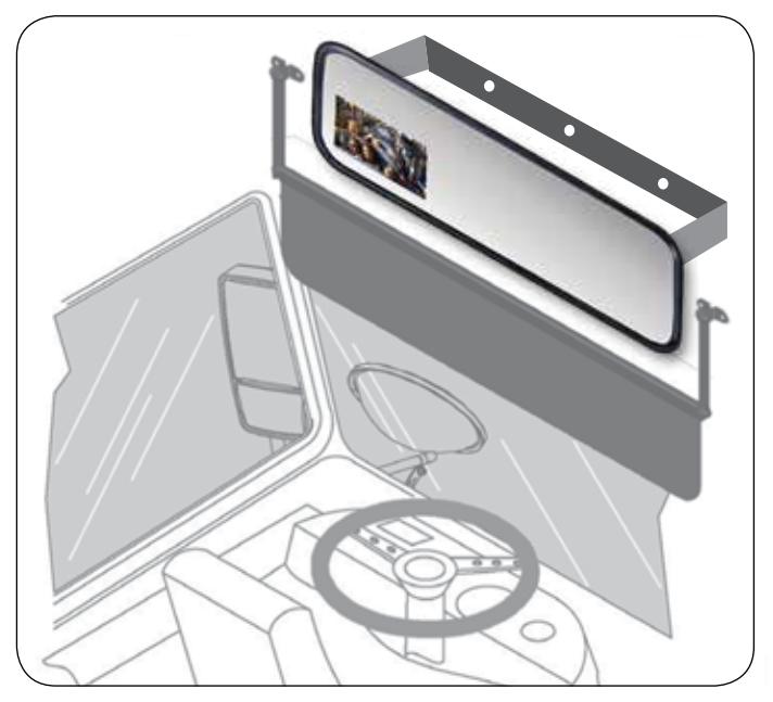
Standard sunvisor and interior mirror configuration