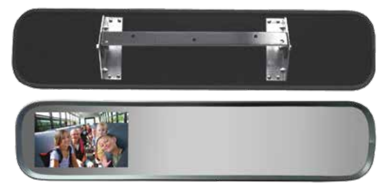
630 (Standard) STSM630 (MOR-Vision w/monitor)