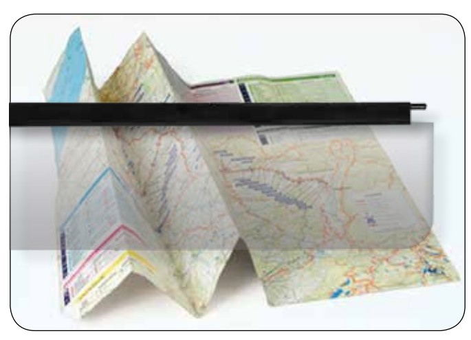
Transparent gray acrylic filters harsh sunlight without reducing visibility