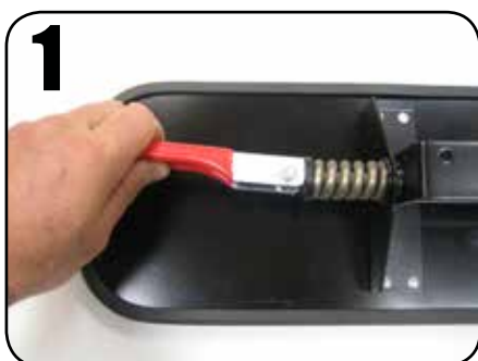
1 Lever in Locked Position

The LeverLock® Interior Mirror System is a design masterpiece that is the culmination of Rosco's years of experience with school bus interior mirrors. By incorporating a newly designed spring-loaded cam/lever system, Rosco has responded to the needs of today's drivers for quick adjustment, and exceptional holding force.