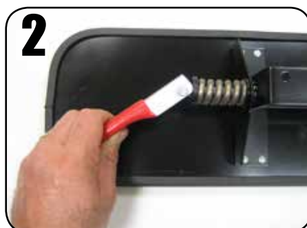
2 Pull Down Lever To Unlock Mirror Position